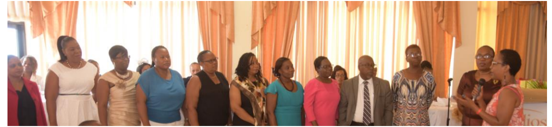
2017 Principal Attendees

Special thanks to our Principals for submitting these students for our 2 nd Scholastic Awards. We pray for God to continue to provide the resources needed for you to continue to build our greater Jamaica through our youths.